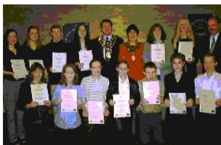
Bronze D.o.E. winners meet the Mayor & Mayoress

The Duke of Edinburgh Award Scheme continues to grow in popularity. A total of 20 pupils were presented with their Bronze Award during this year's Annual Presentation Evening. A County presentation evening was held on 24th November in the Princess Royal Theatre.