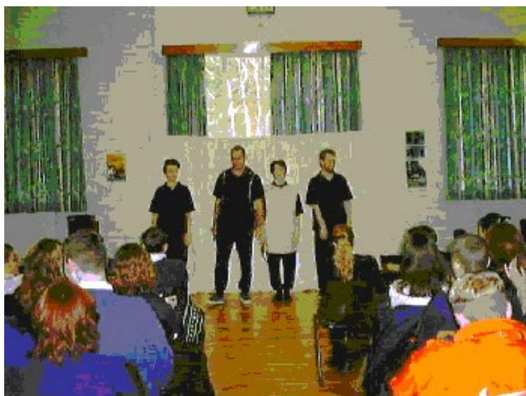
Black Cat Theatre Present "MACBETH" to Year 11 English Groups