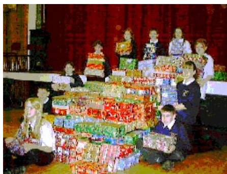
The end result of Operation Xmas Child.