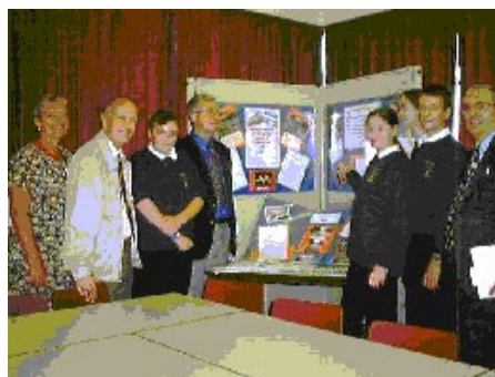
Members of the Crime Prevention Club with Local Councillors.