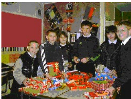
Packing Boxes for Operation Xmas Child.

Year 8 pupils are taking part in the charity appeal "Operation Christmas Child". The charity arranges for shoeboxes filled with small gifts to be sent to children in Eastern European countries.